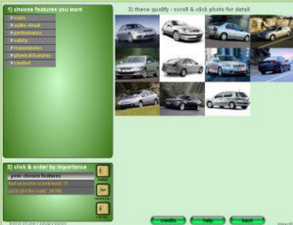
Note: Screen-shots represent test data - not actual values